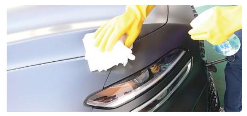
If needed, reapply window cleaner to area and microfibre towel and repeat cleaning—avoid circular motions.