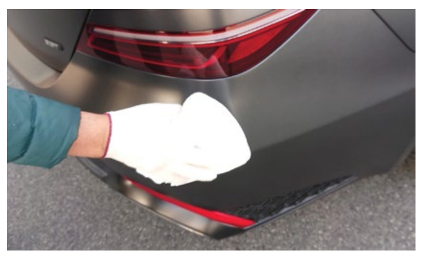
Always use a slightly damp chamois, artificial chamois, or microfibre towel appropriate for a matte finish to dry the paint surface.

For best appearance, use a clean damp chamois, sponge cloth, or microfibre towel to dry your vehicle before it air dries. If the paint surface is starting to air dry, dampen the areas that you are not drying.