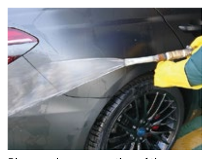
Rinse each soapy section of the vehicle completely before moving to another section. Keep the clean sections wet.