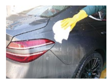
Wash the vehicle lightly, working in small sections from bottom to top.