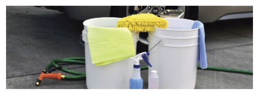
Prepare your equipment and supplies first before soaping up the vehicle.

For hand washing, park the vehicle in a cool, shaded area, out of direct sunlight. Read these procedures thoroughly and prepare your equipment and supplies first before soaping up the vehicle.