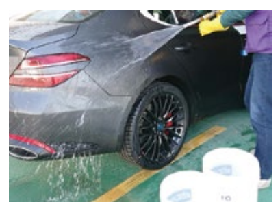
Pre-rinse the vehicle with a hose or pressure washer to cool it and remove debris that can scratch the paint.