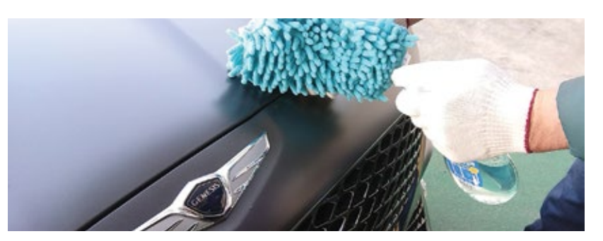
Spot clean by spraying cloth and paint surface with matte paint cleaner first. Do not use a dry towel on the paint finish.

Generally, the preferred method for removing dirt and debris is pressure washing (see Washing Your Vehicle, pages 5–9), but for those times when you need to do a quick spot cleaning to remove tree sap or road debris before it causes damage to the finish, follow these recommendations.