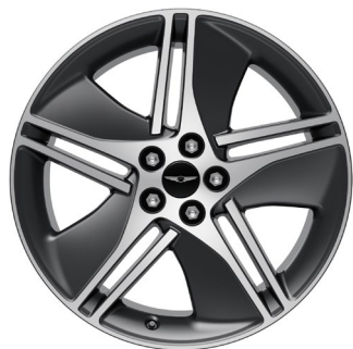
20" Alloy Dark matt grey diamond cut wheels Standard on Dynamic and Luxury grades