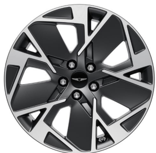
19" Alloy Dark matt grey diamond cut wheels Standard on Pure grade