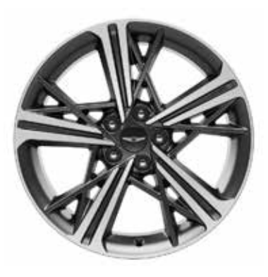
19" Alloy Grey Matt Sport Optional