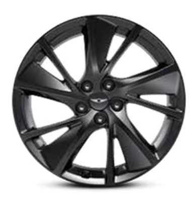
19" Alloy Dark Sputtering Sport Standard