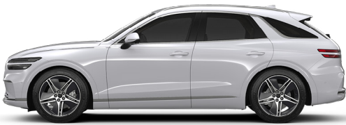
GENESIS ELECTRIFIED GV70 in Matterhorn White