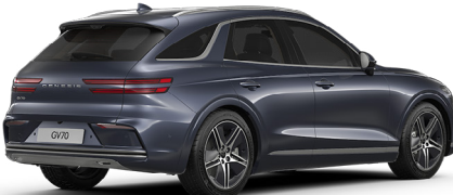
GENESIS ELECTRIFIED GV70 in Ceres Blue