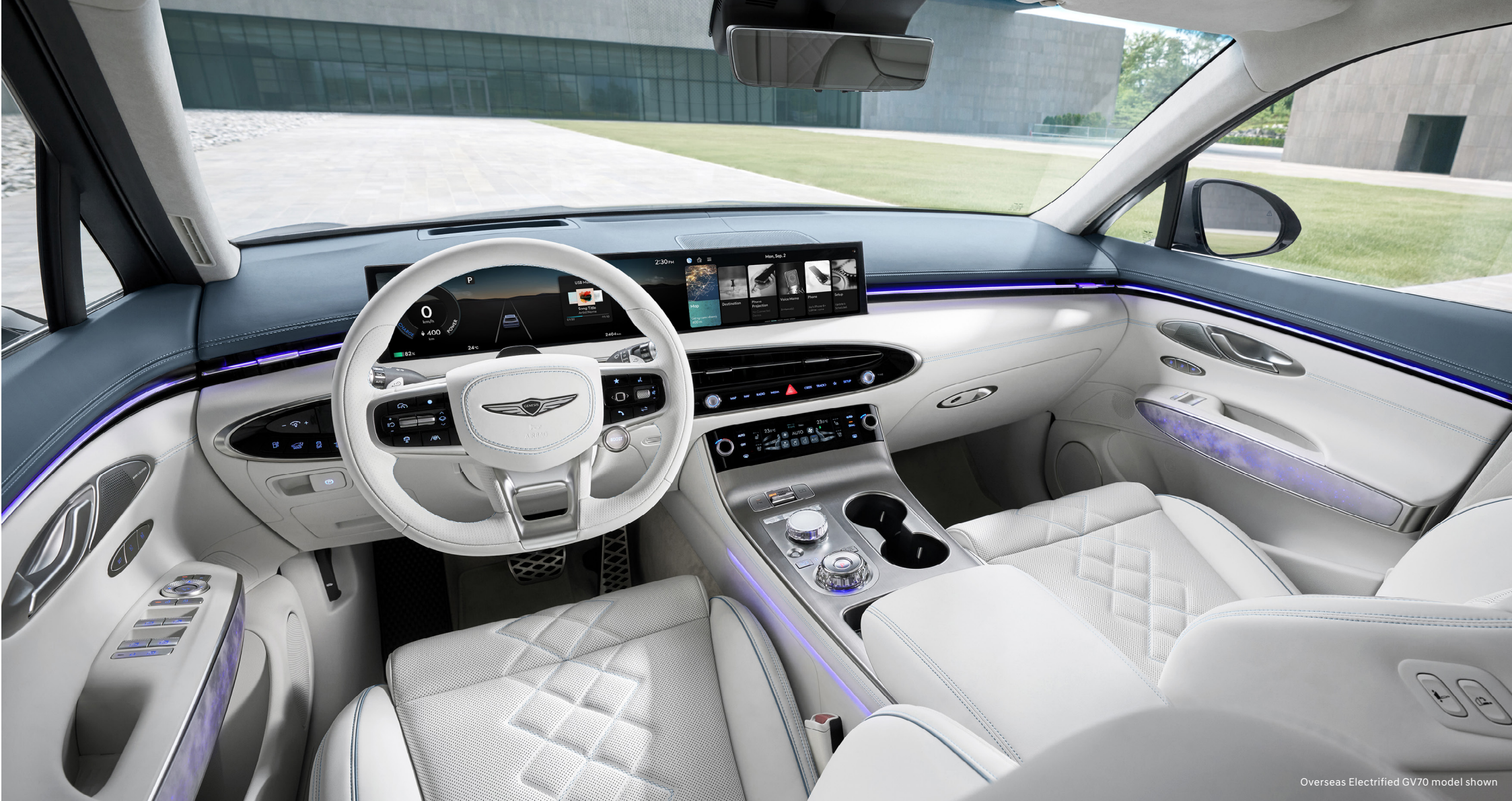
Overseas Electrified GV70 model shown

Featuring interior highlights such as B&O Sound System 5 , massage seat and UV-C sterilisation storage, it brings class-leading convenience and control. And with updates such as the new Forward Collision Avoidance Assist (FCA 2) and Remote Smart Parking, the Electrified GV70 puts you at the centre of one of the world's most advanced luxury SUVs.