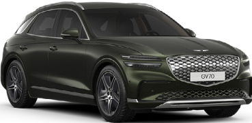
GENESIS ELECTRIFIED GV70 in Storr Green