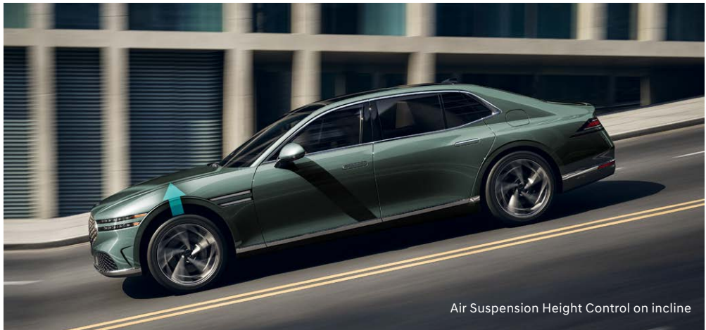
Air Suspension Height Control on incline