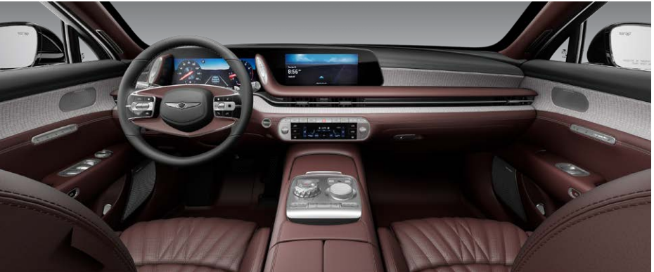
OBSIDIAN BLACK & BORDEAUX BROWN