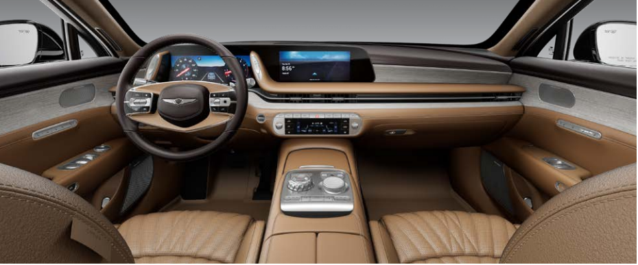
VELVET BURGUNDY & DUNE BEIGE