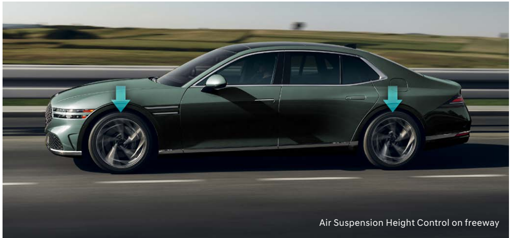
Air Suspension Height Control on freeway