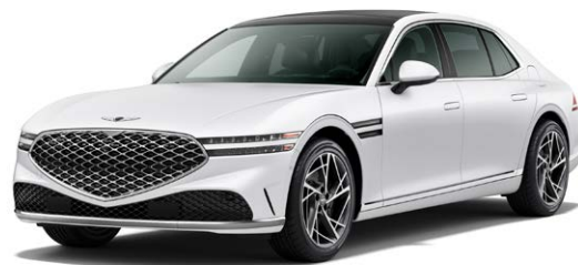
VERBIER WHITE MATTE