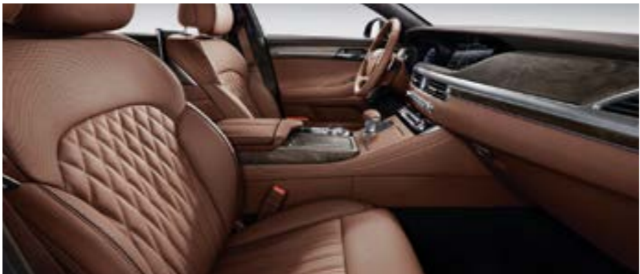
DARK BROWN/HAVANA BROWN LEATHER | OLIVE ASH WOOD