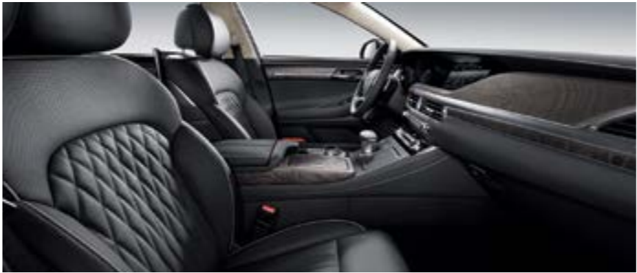
OBSIDIAN BLACK MONOTONE | GRAY ASH WOOD