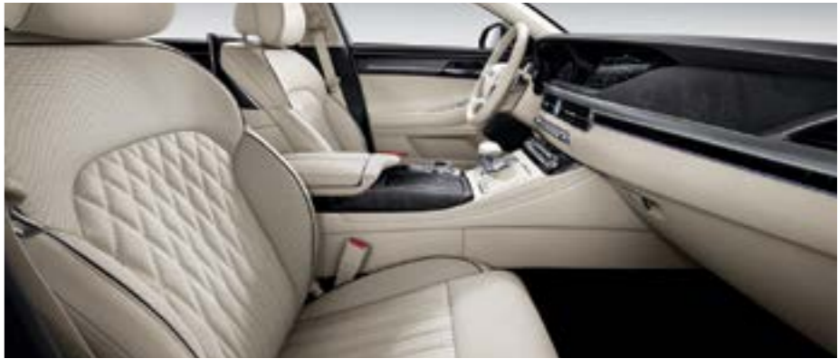
OBSIDIAN BLACK/VANILLA BEIGE LEATHER | BLACK ASH WOOD