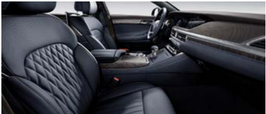
DARK BROWN/INDIGO BLUE LEATHER | GRAY ASH WOOD